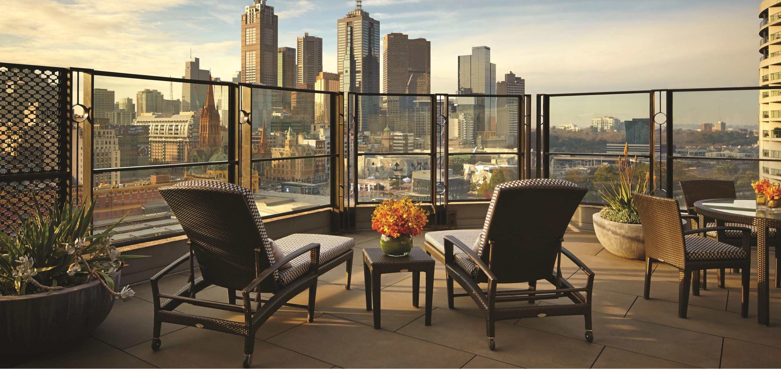
Executive Terrace Room