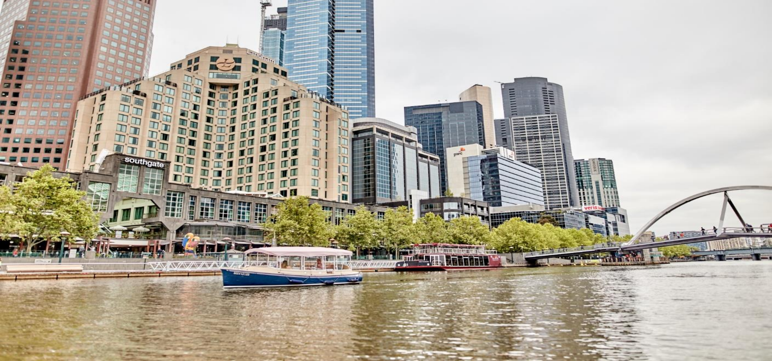
The Langham Boat